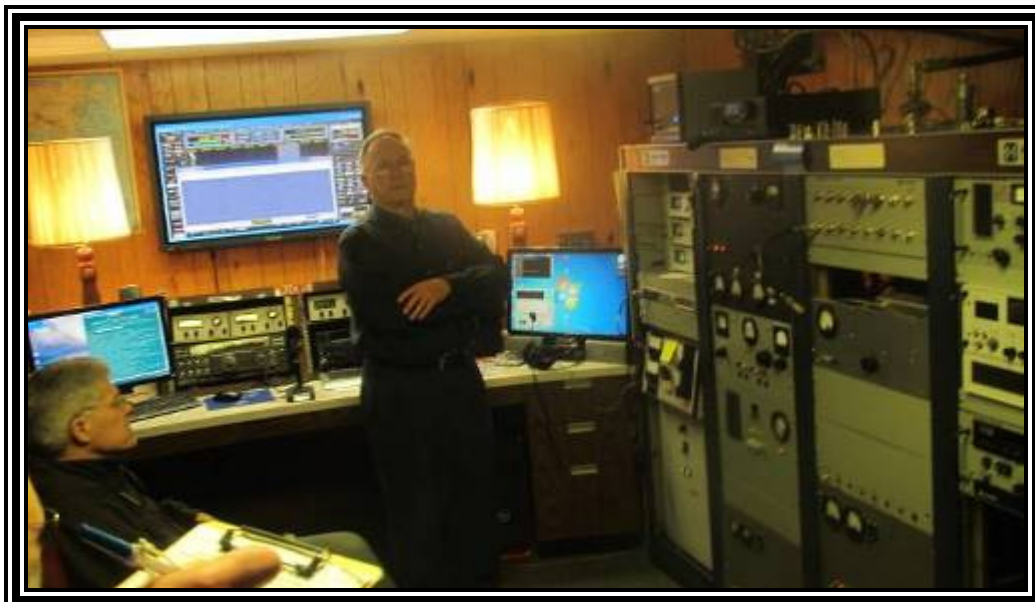
W2CNS explaining his impressive setup for EME

Program: Digital EME or Moon bounce with WSJT Software