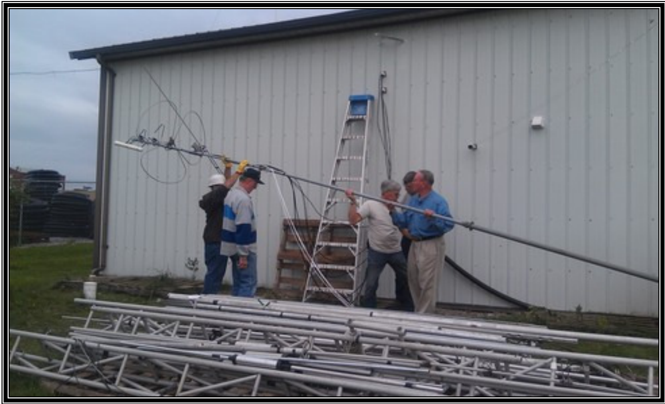
Good view of beacon antennas