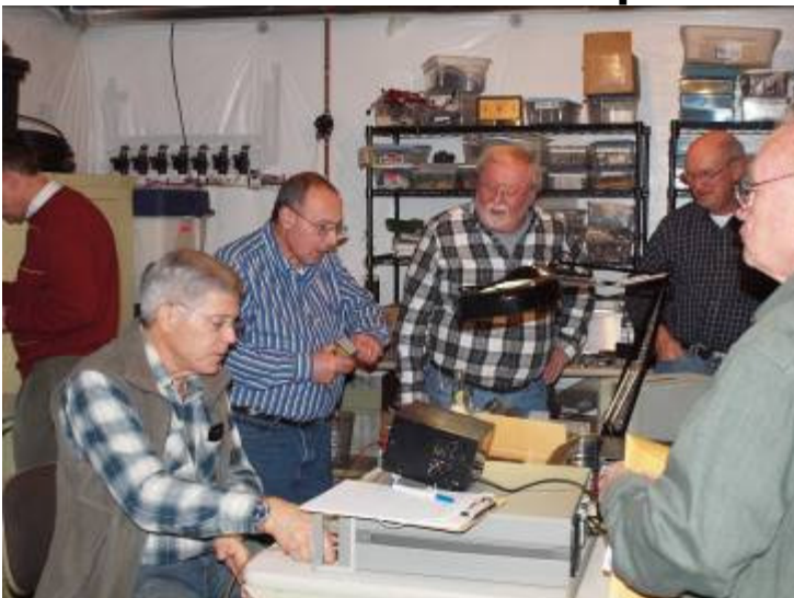
K2DH, K2OS, AB2YI, KV2X, AND W2CNS talk about noise figure measurement